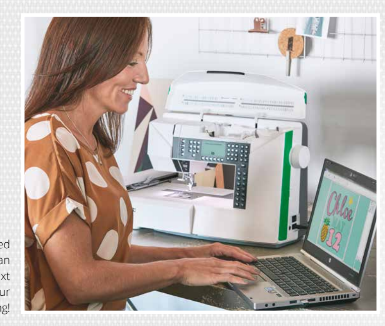
*compared to most other embroidery machines at this price point.