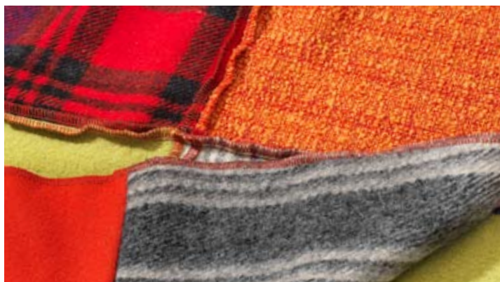
Overlock stitches look so professional you'll be tempted to turn wrong sides right.

The Exclusive SEWING ADVISOR® feature on the HUSKYLOCK™ s25 machine instantly sets the best stitch length, differential feed, and thread tension for the chosen stitch and recommends needles and more for perfect results. Simply enter the type of fabric you are sewing and the settings change automatically.