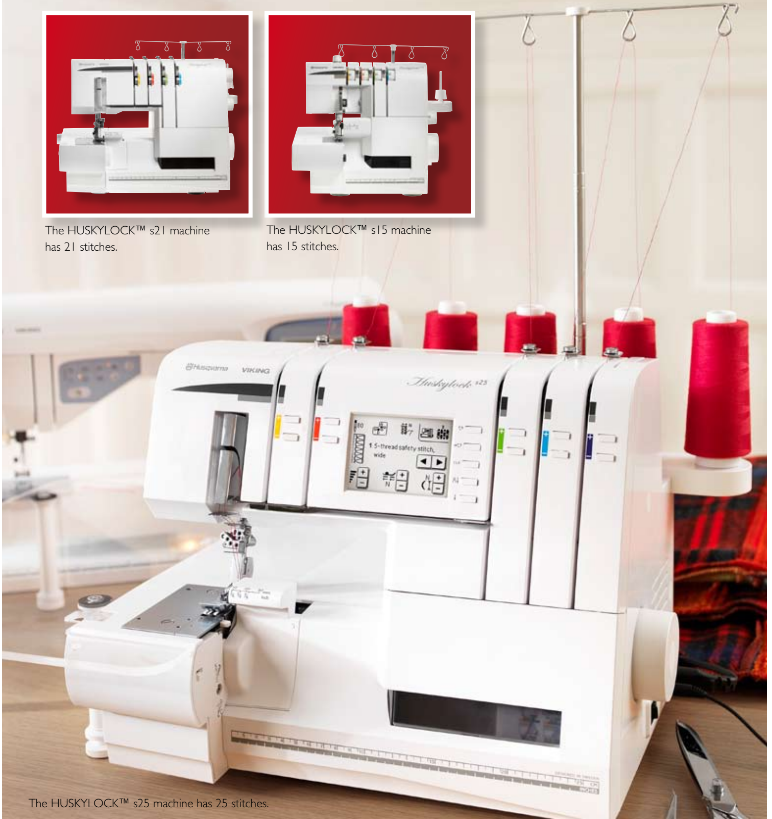
The HUSKYLOCK™ s25 machine has 25 stitches.

The stunning garments and home dec items shown are anything but ordinary. Just like the HUSKYLOCK™ overlock machines, they are innovative from the inside stitches to the outside hems and will inspire you to create unique projects that showcase the convenience and joy of owning a HUSKYLOCK™ overlock. Whether you are just starting your serging journey or are an experienced enthusiast, the HUSQVARNA VIKING® overlock family has an option for you. Your ideal sewing companion awaits.